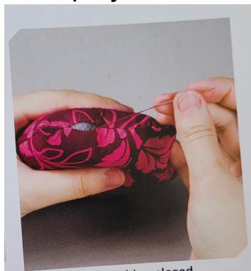
The opening closed.