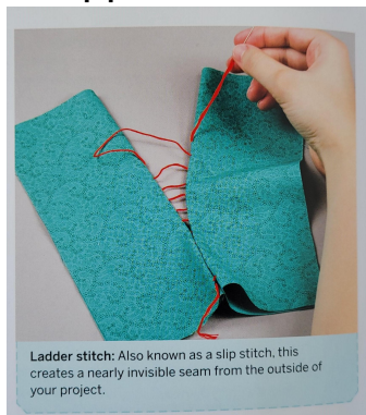
Ladder stitch: Also known as a slip stitch, this creates a nearly invisible seam from the outside of your project.